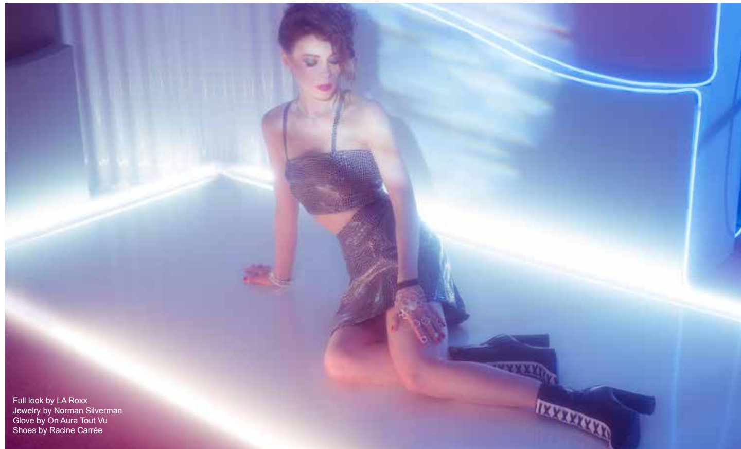
Full look by LA Roxx Jewelry by Norman Silverman Glove by On Aura Tout Vu Shoes by Racine Carrée